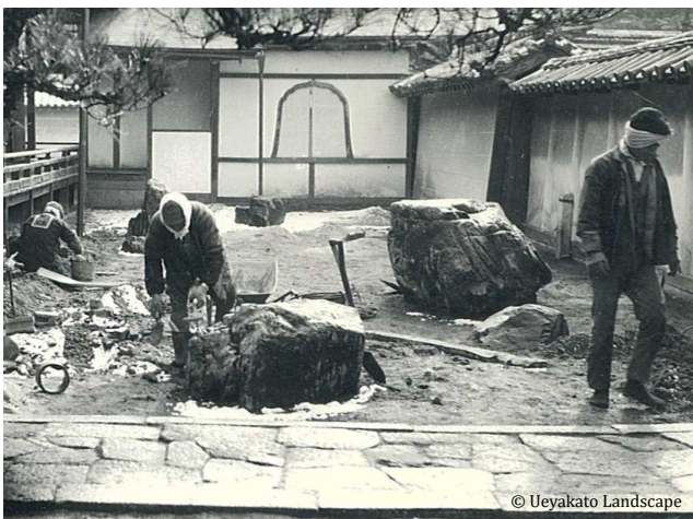
Building of Kohōjō Garden ("Nyoshin-tei") of Nanzen-ji Temple, 1966