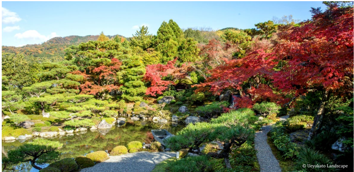
Tairyu-Sansō Villa Garden: Fostering scenery by cooperating with owners and neighbors