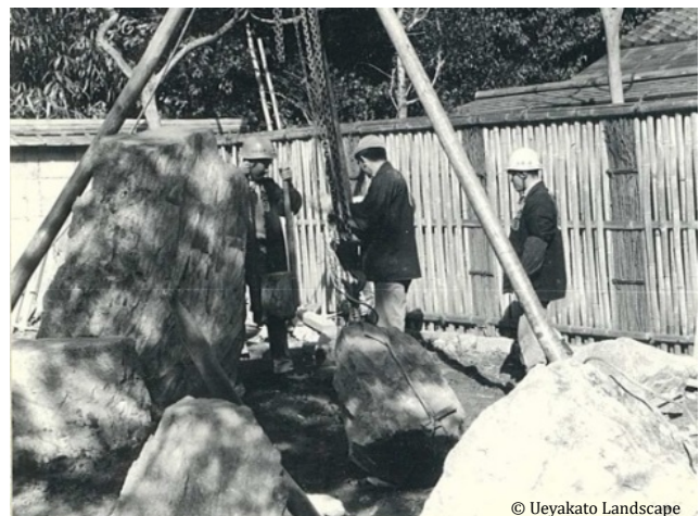
Building of "Rokudō-tei" Garden of Nanzen-ji Temple, 1967